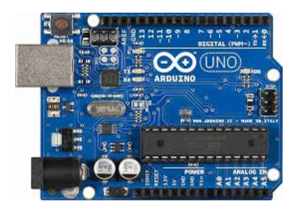
Figure 4 Servomotors

The Main Algorithm for condition for Correct Steering is: int angle(int v){ x = (M_PI^*v)/180; d = tan(x);y=atan((l*d)/(l+(w*d))); z = (y^*180)/M_PI; return z; } This is derived from equation: \operatorname{Cot}\,\varphi-\operatorname{Cot}\,\theta=w/l PROGRAM FOR TRANSMITTER #include<SPI.h> #include<nRF24L01.h> #include<RF24.h> #include <printf.h> #include "Wire.h" #include "I2Cdev.h" #include "MPU6050_6Axis_MotionApps20.h" //#include "MPU6050.h" // not necessary if using MotionApps include file MPU6050 mpu; bool blinkState = false; float angle_pitch_output, anglep, angler, angle_roll_output; byte transpitch, transroll, strangle; // MPU control/status vars bool dmpReady = false; // set true if DMP init was successful uint8_t mpuIntStatus; // holds actual interrupt status byte from MPU uint8_t devStatus; // return status after each device operation (0 =success, !0 =error)uint16_t packetSize; // expected DMP packet size (default is 42 bytes) uint16_t fifoCount; // count of all bytes currently in FIFO uint8_t fifoBuffer[64]; // FIFO storage buffer // Orientation/motion variables