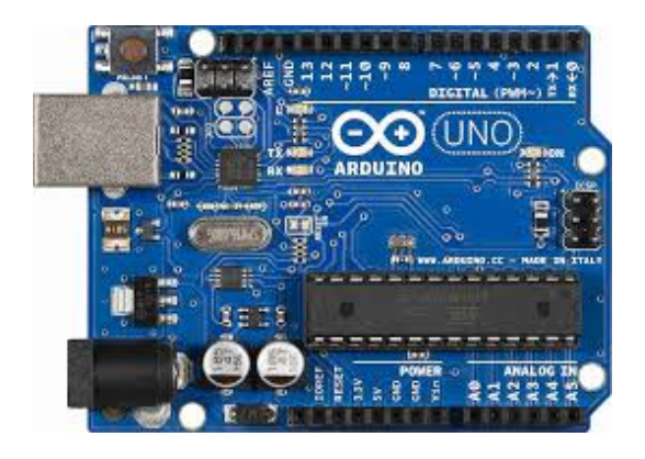
Figure 3 Arduino

Arduino programs are written in C/C++. The Arduino IDE comes with lots of software/hardware library. The files make many common input/output operations much easier. And it's easy to program even for a beginner. The Arduino programming environment is easy-to-use for beginners, yet flexible enough for advanced users to take advantage of as well.